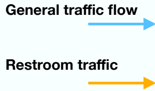
Chart C - Key